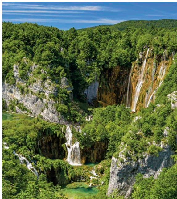
Plitvice Lakes National Park

Discover the bounty of Croatia on this incredible 10-night journey, including a seven-night Adriatic cruise! Explore one of the world's best-preserved medieval towns in legendary Dubrovnik. Then set sail along the Dalmatian coast on your first-class ship to enchanting islands and timeless ports. Walk along cobblestones brimming with maritime legends and see landscapes that stir your soul. Choose between touring the Cathedral of St. James or Krka National Park in Šibenik. Plus, revel in the wonders of Plitvice Lakes National Park, an astonishing natural marvel, before capping off your adventure in cosmopolitan Zagreb.