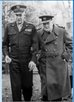
President Dwight D. Eisenhower with Winston Churchill