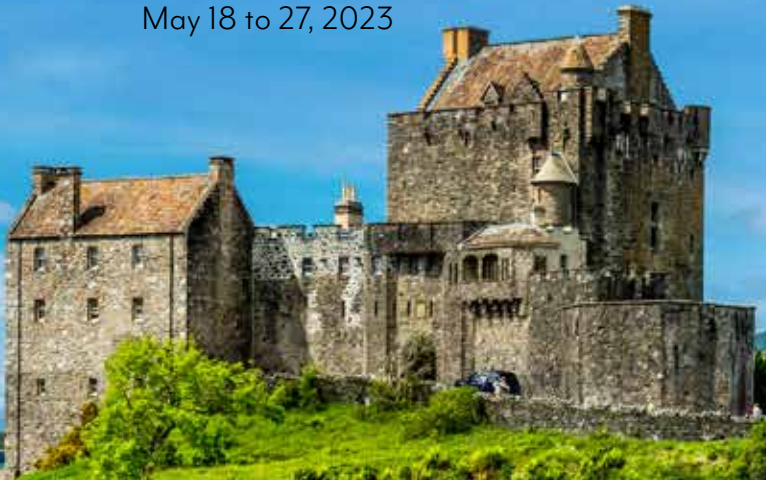
Eilean Donan Castle