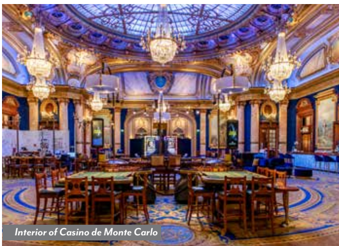
Interior of Casino de Monte Carlo

Stroll through the Old Town of Portoferraio to see ancient Medici fortresses; the Church of Misericordia; Forte Stella;