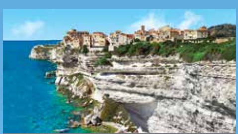
Cliffs of Bonifacio