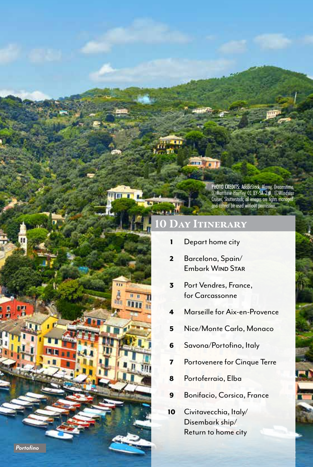
PHOTO CREDITS: AdobeStock, Alamy, Dreamstime, ©Matthew Hatfield CC BY-SA 2.0, ©Windstar Cruises, Shutterstock; all images are rights managed and cannot be used without permission.