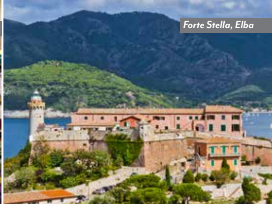
Forte Stella, Elba

and Napoleon's former home of Villa Dei Mulini. See the majestic Napoleonic Theatre of Vigilanti and the Porta Mare.