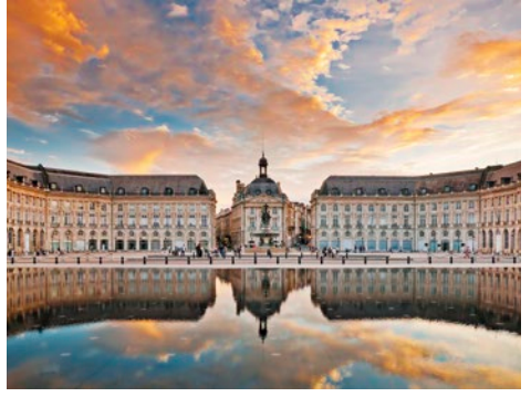
Miroir d'Eau, Place de la Bourse

Laguardia. Soak up the wonderful ambience of the capital of Spain's Rioja Alavesa wine region on a guided walk. See the medieval fortifications, the Romanesque church, the Plaza Mayor and the underground tunnels.